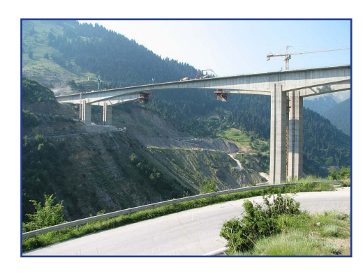
Metsovo Bridge is a single box girder bridge located in the north of Greece.

Another Solution using GeoSIG instruments and a capable Partner effectively showing that quality and reliability can also be cost-effective.