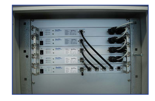
The CR-5P central recording unit integrates the digitiser board and an industrial PC in one platform.